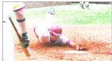
Major League Sports Editor