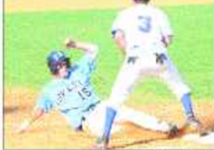
Major League Sports Editor